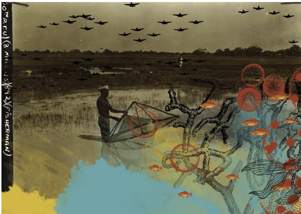
Sunandini Banerjee, Untitled , Digital collage printed on archival paper, 23 x 36 inches

USC Pacific Asia Museum 46 N Los Robles Ave Pasadena, CA 91101